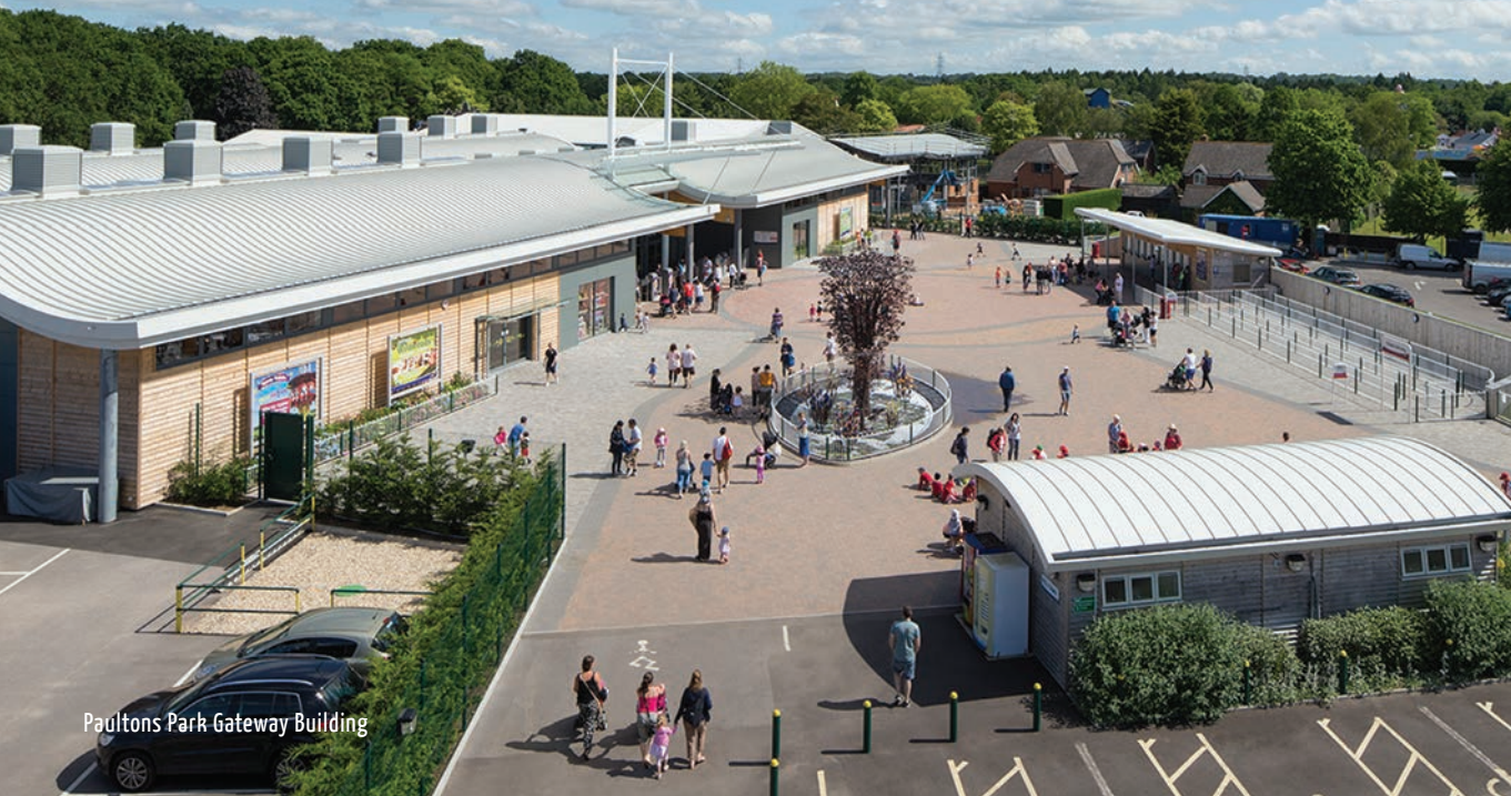
Paultons Park Gateway Building